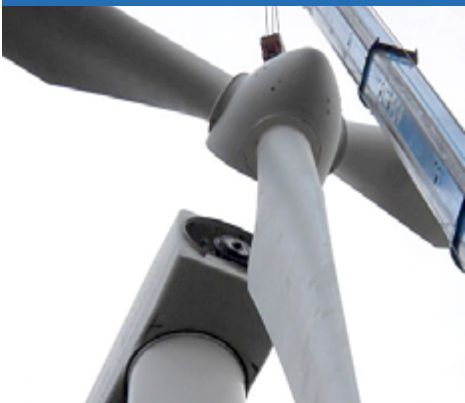
Consulting and appraisals