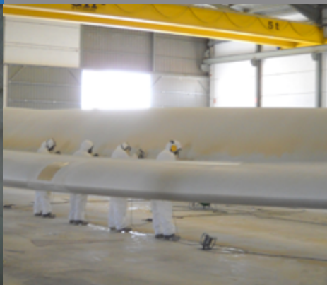
Repair in the factory