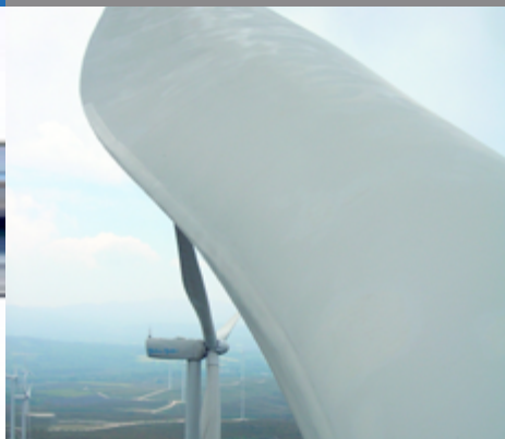
Supply of materials