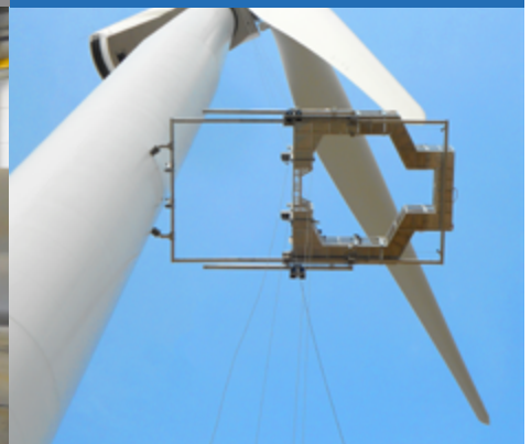
Repair with suspended platform